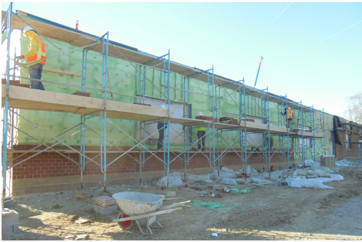
Great Bridge Primary School Replacement Project