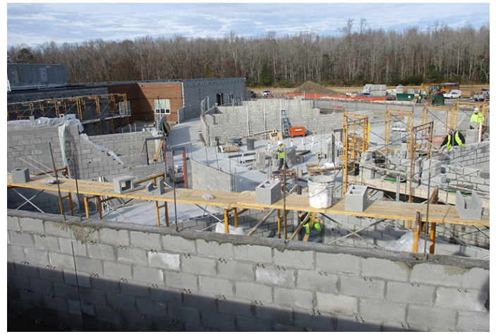
Hickory Middle School Building Addition Project